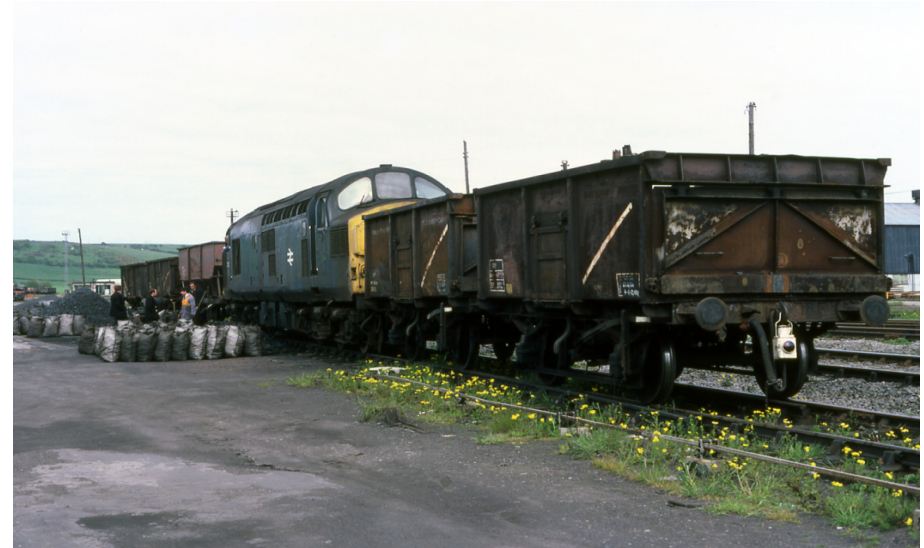
37003 shunts Carlin How coal depot - 26th May 1983